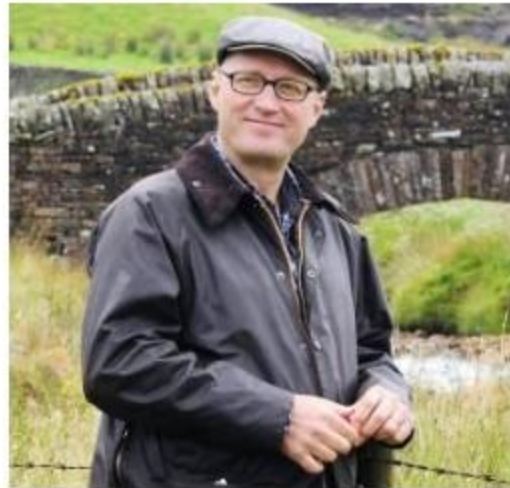
VISIT: Adrian Edmondson

Click to move your TV Licence online now >>