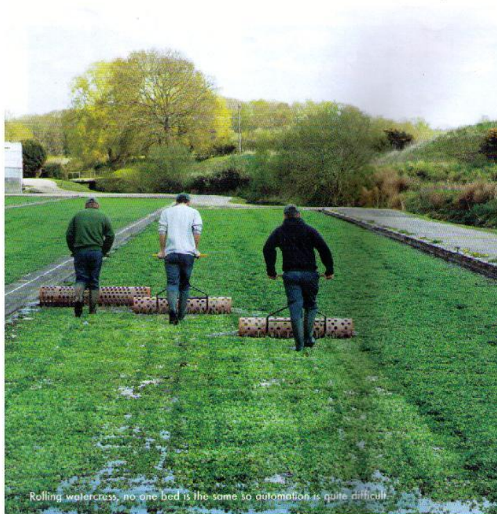
Rolling watercress, no one bed is the same so automation is quite difficult