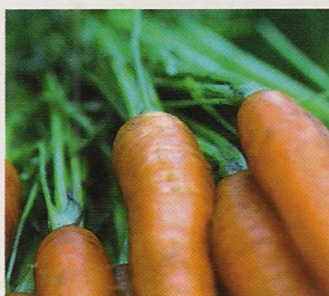
The Norfolk carrot firm is to close

The "unmissable auction" is run by Clarke Fussells and includes multi-head weighers,